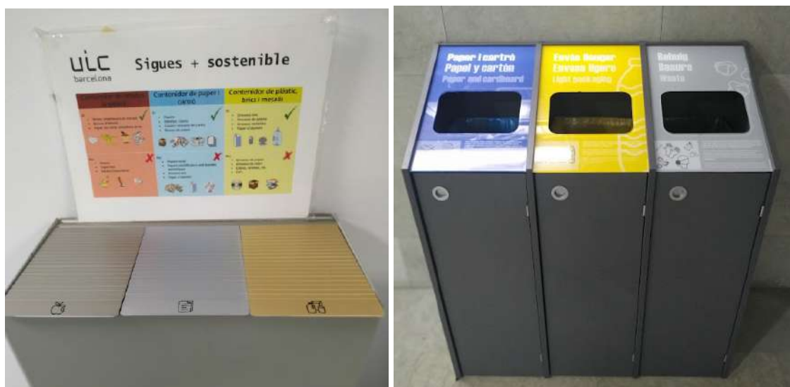
Figure 1. Containers for other types recyclables in both UIC Campus Barcelona (left) and Campus Sant Cugat (right)