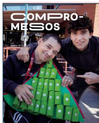
Figure 2. A recycled Advent calendar