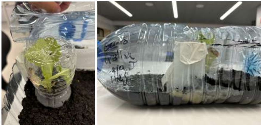
Figure 4, 5. Water cycle simulation and a greenhouse with water bottles. Subject: Teaching of Experimental Sciences