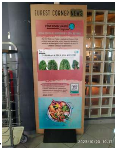
Figure 2. "Stop Food Waste" poster in Eurest, Iradier's restaurant