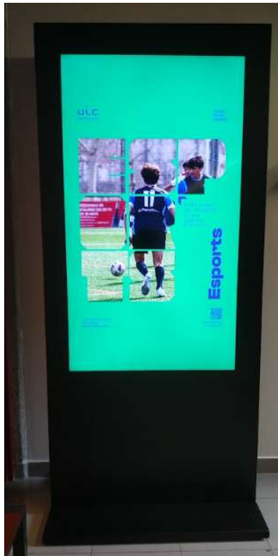
Figure 1. Informational screen announcing the university's current activities