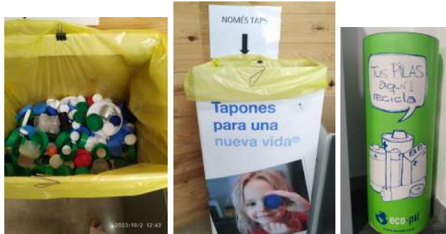
Figure 3. Containers for plastic bottle caps and batteries