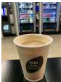
Figure 8. Sustainable cardboard cups (cafeteria and vending machines)