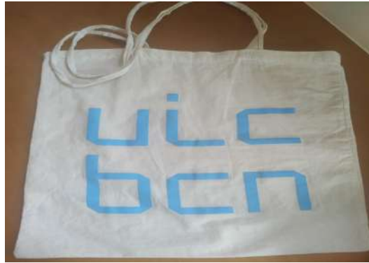
Figure 6. The university's promotional bags