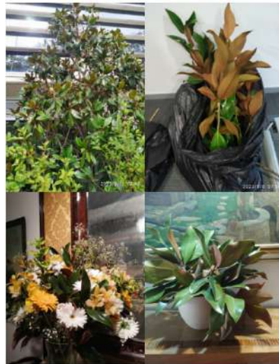
Figure 7. Reuse plant waste from the magnolia trees for floral centers