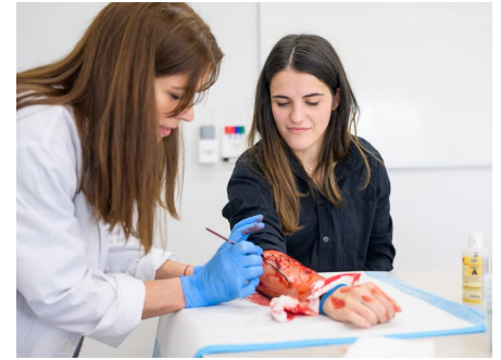
Wound creation using moulage