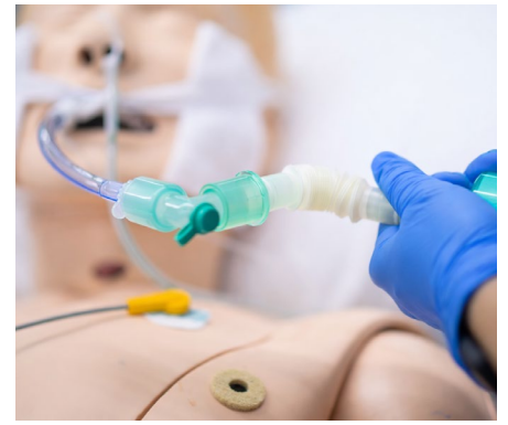
Critically ill patient