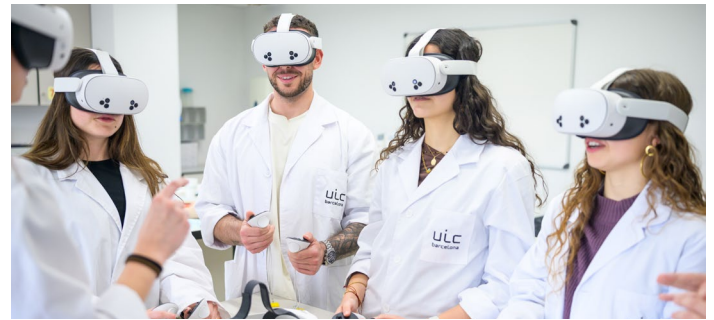
Virtual reality simulation