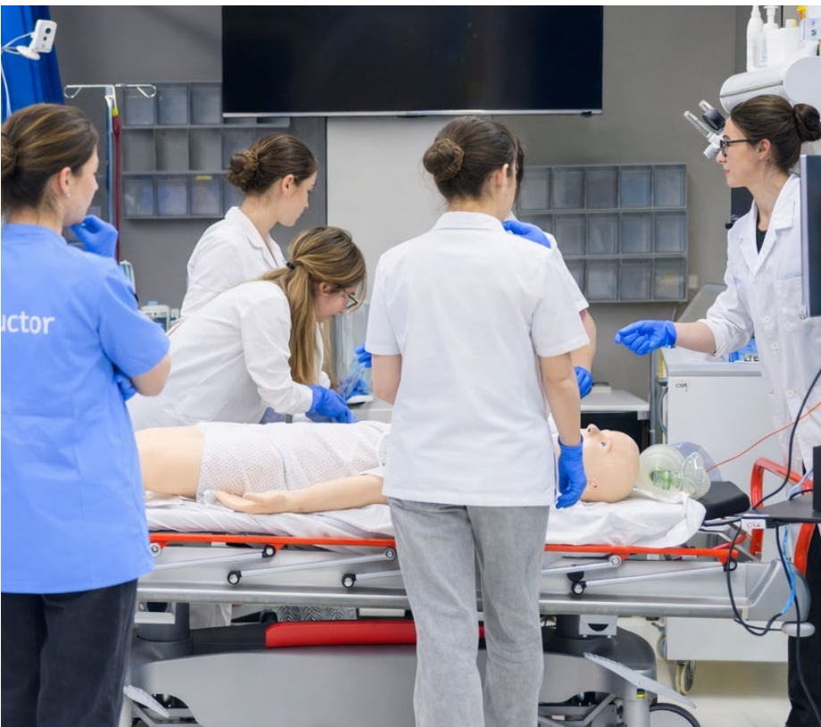
Advanced life support