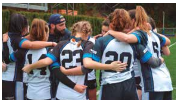
Official women's rugby team. Catalan University Championships