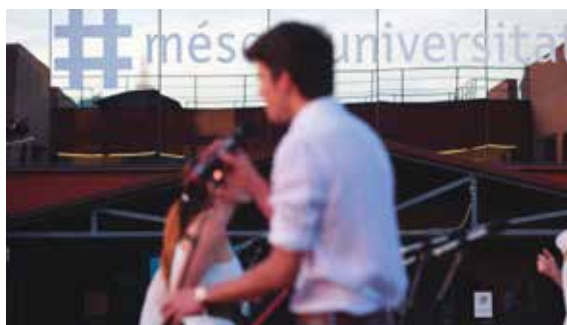
Gospel choir concert. End of year party

In UIC Barcelona we promote and organise sports activities and competitions, and we provide discounts and special conditions for access to sports facilities to keep you in shape and live healthier lives. During the course, we organise charitable activities in cooperation with multiple institutions and advise regarding volunteer work. You can take an active part in #UICSocialDay a day on which the whole University comes together to help those most in need. You can also form part of theatre, debate, painting and music groups, which foster the cultural side of UIC Barcelona and help you acquire more skills and values.